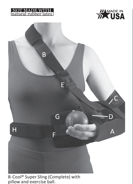
Figure 1: Shoulder strap buckle (E)