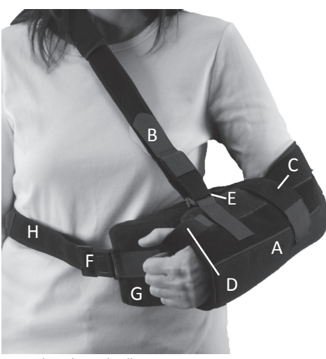
Super Sling Plus with pillow.